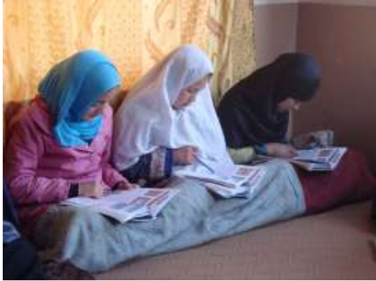
Afghani girls studying in school (something previously banned by the Taliban)