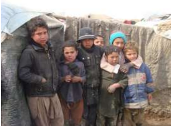
Children in Afghanistan refugee camp